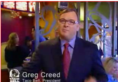
Taco Bell President Greg Creed addressed its customers after an e-coli outbreak at some of its stores.

More than 100 people who had eaten at Taco Bell restaurants on the east coast were sickened by E. coli bacteria. The story broke in